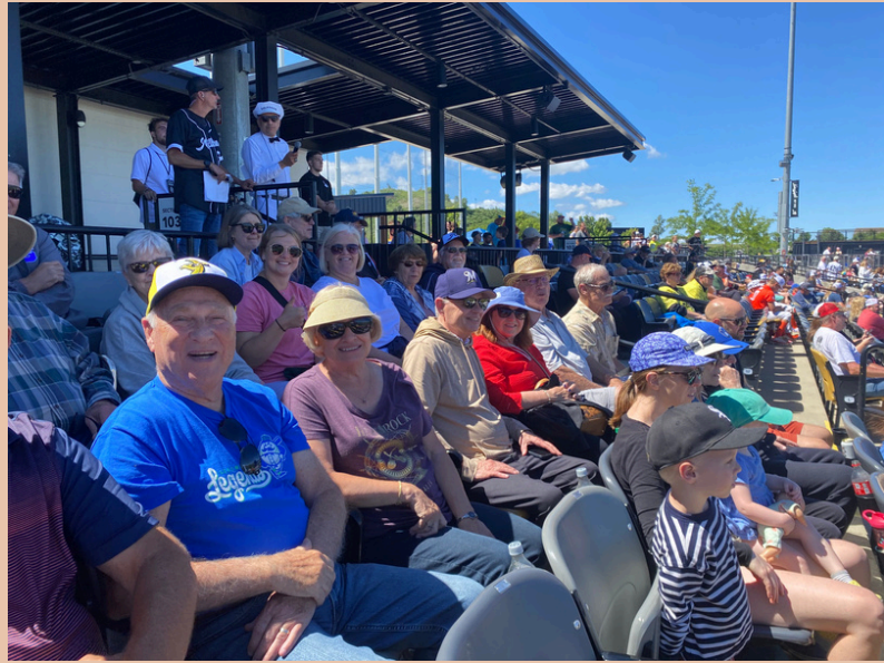
Speaking of the Milwaukee Milkmen...